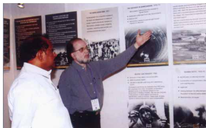
Visit of the Hon'ble Minister of State to the Exhibition During Past IDMC

FICCI has been given the responsibility of organising the Exhibition on May 13-14, 2013 at Vigyan Bhawan, New Delhi in consultation with the Technical Committee of the NPDRR. An exhibition of display of innovative ideas, projects, products and services in the field of disaster risk reduction is being organized along with the conference.