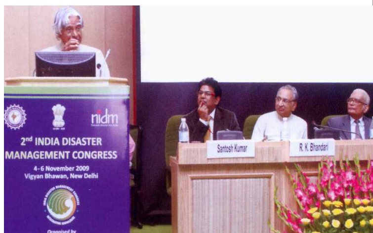
Valedictory Ceremony of Second India Disaster Management Congress (IDMC)