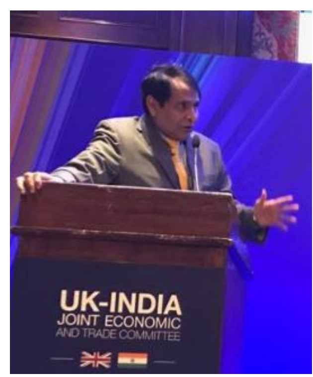
Shri Suresh Prabhu, Honorable Minister of Commerce and Industry, Government of India at the plenary session of the twelfth meeting of the India-UK Joint Economic and Trade Committee (JETCO).