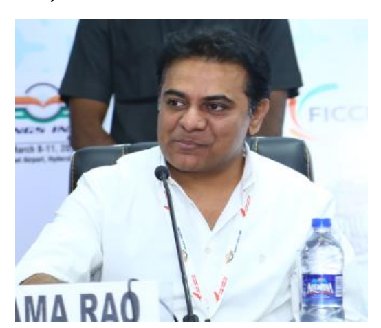
Shri K T Rama Rao, Minister for IT E&C, MAUD, Industries & Commerce, Government of Telangana