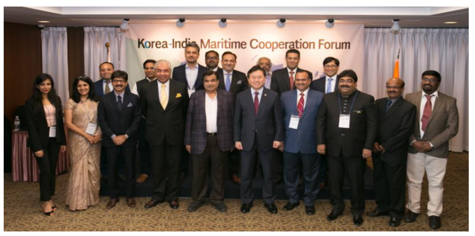
High-level ministerial and business maritime delegation to the Republic of Korea at the Korea- India Maritime Cooperation Forum in Busan, South Korea

FICCI along with Ministry of Road Transport, Highways and Shipping took a high-powered maritime delegation to the Republic of Korea on 9-12 April 2018. The delegation focussed on strengthening economic ties between India and Korea through partnerships in the transport infrastructure space. The engagements for the delegation in Korea included business seminar, B2B meetings, interactive meetings with Korean Government officials / agencies and site visit.