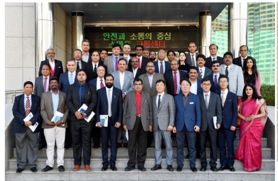
High-level ministerial and business delegation on Infrastructure (Road & Highways and Maritime) to the Republic of Korea at National Transport Information Centre in Seoul, South Korea

FICCI along with Ministry of Road Transport and Highways took a Road and Highways Infrastructure delegation to South Korea from 11-12 April 2018, along with senior officials from the Ministry. The delegation aimed to strengthen economic ties between India and Korea through partnerships in the transport infrastructure space.