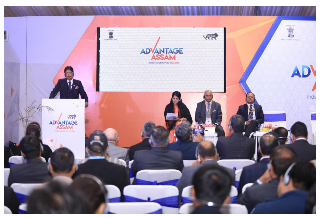
Sectoral session on River Transport & Port Townships at Advantage Assam

FICCI along with the Government of Assam is organized its maiden Global Investors' Summit – ADVANTAGE ASSAM from 3-4 February, 2018 with FICCI as the Summit partner. The Summit aimed at promoting Assam as India's Expressway to ASEAN and showcased the economic and manufacturing strength of Assam. As part of the summit, a sectoral session on River Transport & Port Townships was organized on 4 February 2018 at Sarusajai, Guwahati.