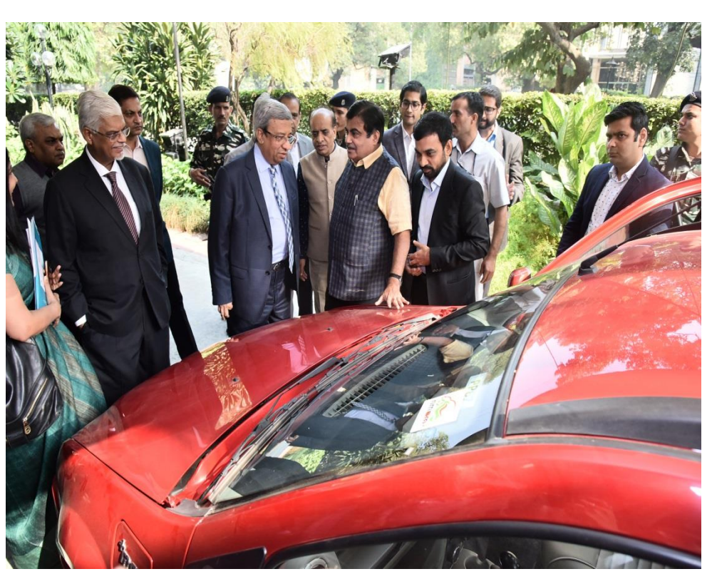
Shri Nitin Jairam Gadkari, Hon'ble Minister of Road Transport, Highways, Shipping, Water Resources, River Development and Ganga Rejuvenation, Government of India examining the Mahindra Electric Car on display at the Smart Mobility Conference;

The conference opened dialogue on sustainable, digital and integrated mobility. On the occasion, FICCI also announced the setting up of a task force on E-mobility, with representation from key stakeholders including government officials, key policymakers, leading infrastructure developers, academicians, automobile companies and city planners among others.