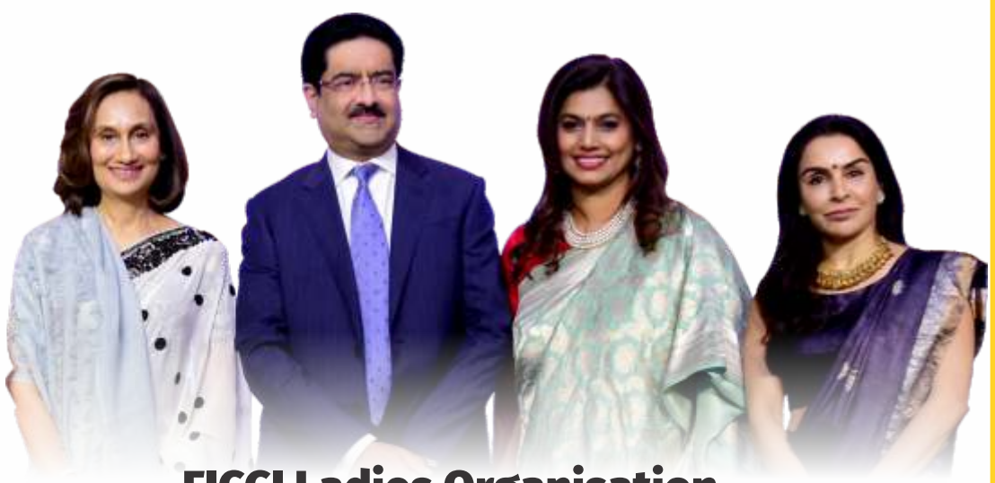
FICCI Ladies Organisation Annual General Meeting 2019