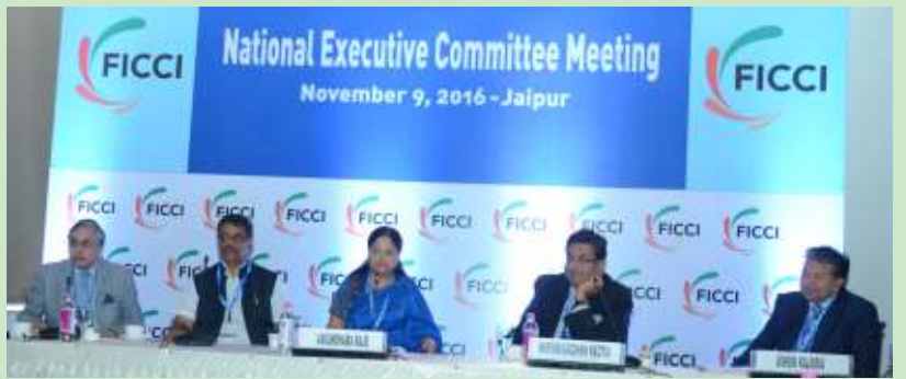
Hon'ble Chief Minister interacting with FICCI NECM members

In conjunction with Global Rajasthan Agritech Meet (GRAM), FICCI National Executive Committee Meeting was also organised which was addressed by Smt Vasundhara Raje, Hon'ble Chief Minister, Government of Rajasthan. Hon'ble Chief Minister discussed the developmental agenda of Rajasthan and some latest initiatives taken by Rajasthan Government with National Executive Committee members.