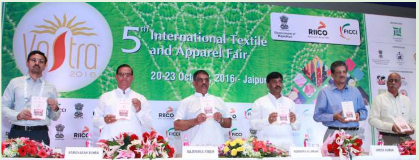
Vastra Fair directory being unveiled during the Inaugural Session

The event witnessed participation from 179 exhibitors, 70 foreign buyers from 22 countries, 117 representatives from 92 Indian buying houses. The Design Wall display featured more than 20 kiosks displaying various textile products in an innovative and creative manner by the aspiring entrepreneurs.