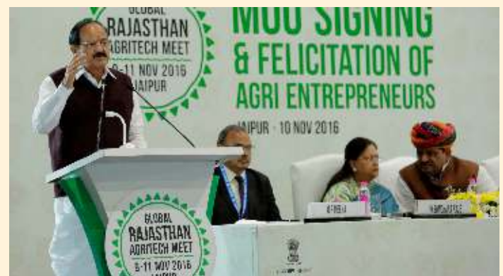
Shri Venkaiah Naidu, Hon'ble Union Minister for Urban Development Housing addressing at MoU signing ceremony during GRAM

In presence of Shri Venkaiah Naidu, Hon'ble Union Minister for Urban Development & Housing, Urban Poverty Alleviation & Parliamentary Affairs, Government of India, 38 MoUs with a total value of Rs 4400.89 crore were signed for investments in agri and allied sectors which will provide 19293 direct and 27379 indirect employment in the state. 13 people who have performed extraordinarily in the agriculture and allied sectors were awarded by the dignitaries during the MoU signing ceremony.