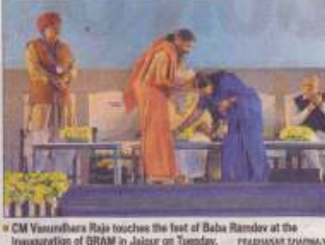
CM Vasudeva Raju touches the feet of Baba Ramdev at the inauguration of GRAM in Jaipur on Tuesday.

NEED OF THE HOUR Ways have to be found out to bring back farmers who have migrated to cities, says governor Kalyan Singh