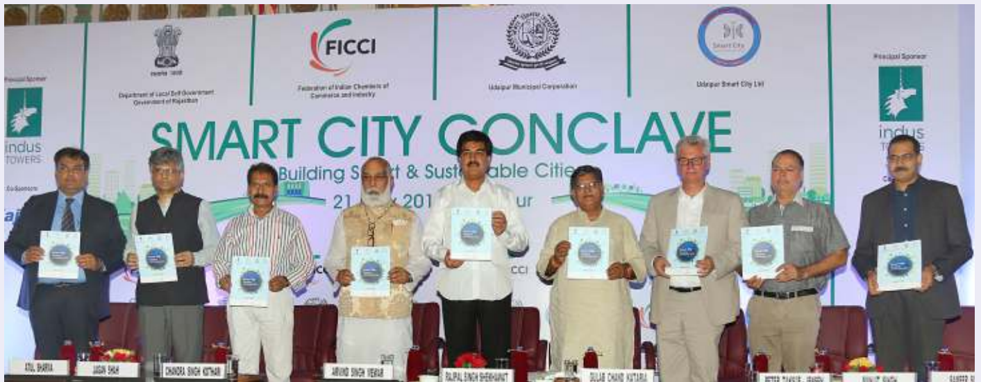
Release of Theme Paper of Smart City Conclave