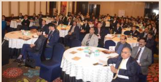
Participants during the HR Summit

The programme witnessed participation from over 15 Speakers and 125 delegates.