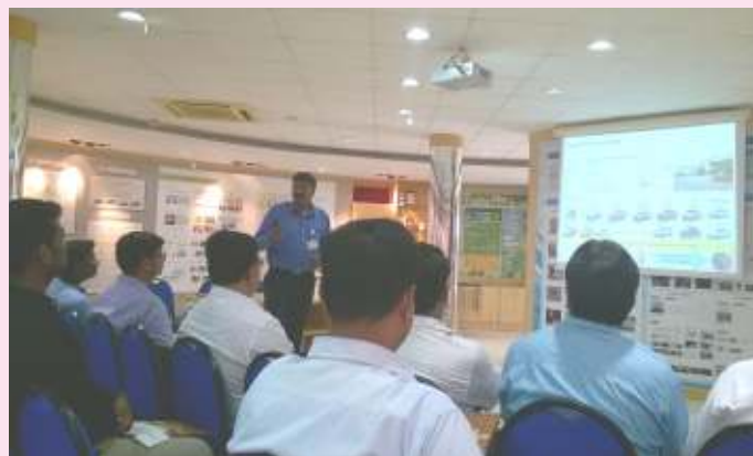
Official from Toyota Kirloskar making the presentation on Best Manufacturing Practices

Under its MANUFACTURING EXCELLENCE MISSION to promote learning by sharing, FICCI Rajasthan State Council organized a Study Mission to Toyota Kirloskar Motors Pvt Ltd, Bangalore. The Mission focused on improving the competitiveness of manufacturing units through learning on latest technology, innovation, service delivery, lean manufacturing and defect free products for Zero Defect and Zero Effect (ZED), skill development, training, etc.