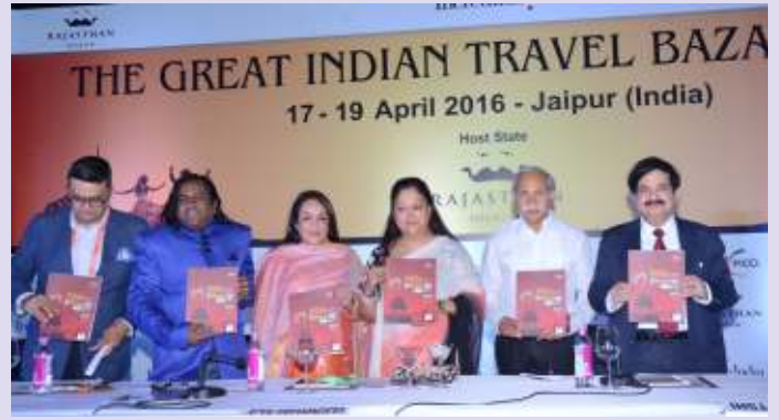
Release of FICCI – MRSS Knowledge Paper on "Indian Inbound – Tapping the Power Packed Growth Engine"

The 8 th edition of The Great Indian Travel Bazaar was held from 17 – 19 April 2016 at Jaipur. This international mart was organized by the Department of Tourism, Government of Rajasthan; Ministry of Tourism, Government of India and Federation of Indian Chambers of Commerce and Industry (FICCI).