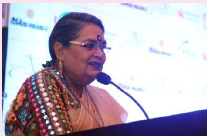
Ms Usha Uthup, Famous Singer & Socialist

FICCI in association with Prabha Khaitan Foundation organised an interactive session with Ms Usha Uthup, Famous Singer & Socialist.