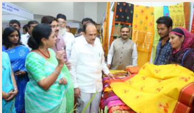
Shri Mohammad Mahmood Ali, Hon'ble Deputy Chief Minister of Telangan admiring the fine work of Artisans