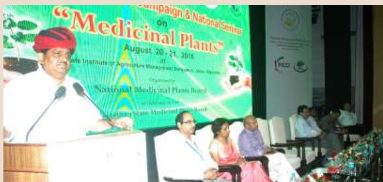
Shri Prabhu Lal Saini, Hon'ble Agriculture Minister, Government of Rajasthan addressing during the Inaugural Session

During the event, an Interactive Meet cum Seminar was also organized on Medicinal Plants involving farmers, experts, traders, industries and other stakeholders of medicinal plants sector.