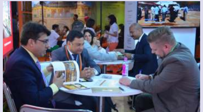
B2B meetings in progress with FTOs