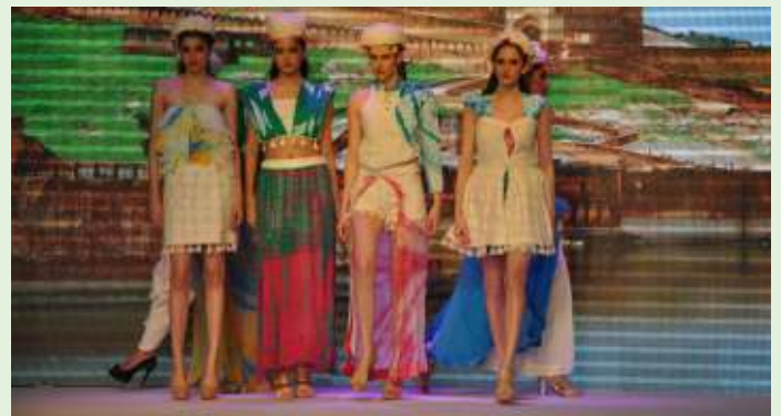
Fashion show during the fair