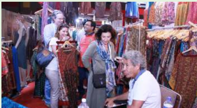
Foreign buyers interacting with exhibitors at the Vastra Fair 2016