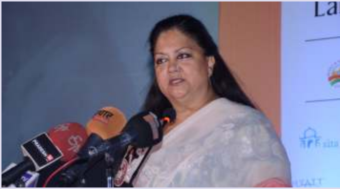
Smt Vasundhara Raje, Hon'ble Chief Minister of Rajasthan during 8th edition of GITB