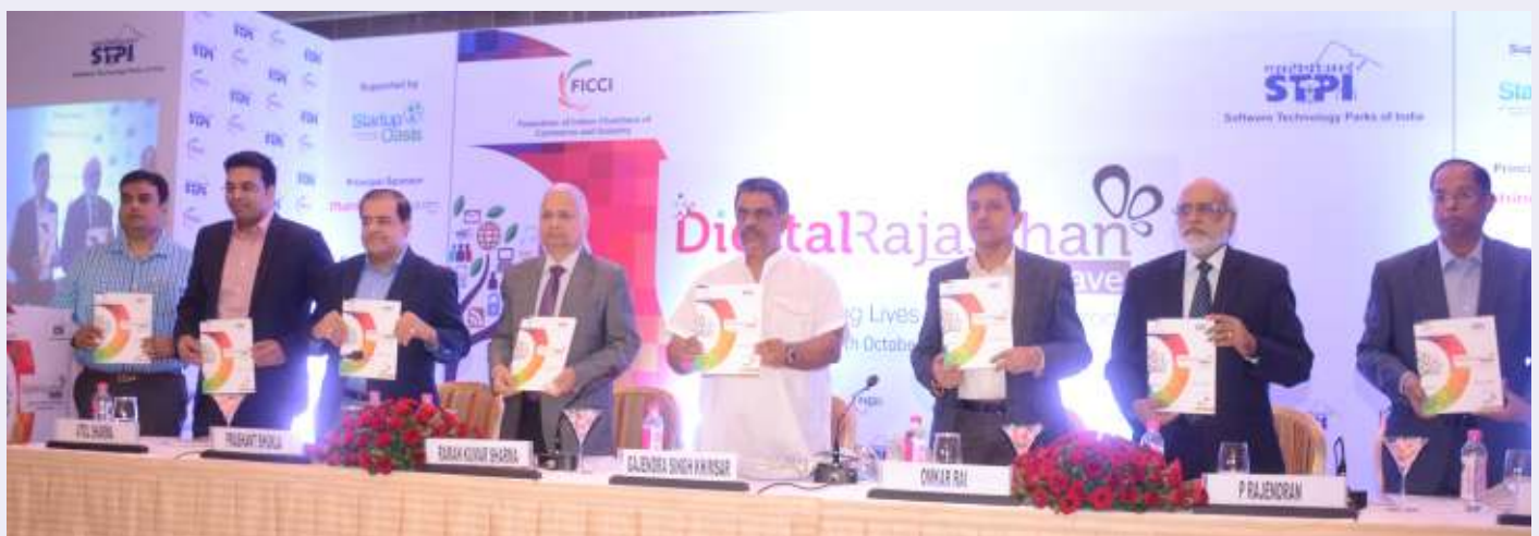
Release of Theme Paper on Transforming Lives through Technology