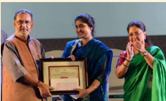
Shri Radha Mohan Singh, Hon'ble Union Minister for Agriculture and Farmers Welfare awarding woman farmer