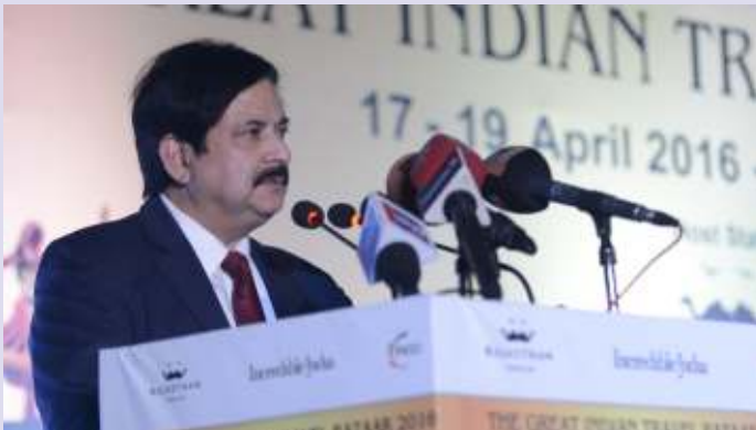
Mr Vinod Zutshi, Secretary – Tourism, Government of India during the inaugural session

Smt Vasundhara Raje, Hon'ble Chief Minister of Rajasthan was the Chief Guest during the inaugural session of the programme. Hon'ble Chief Minister made a fervent appeal to the trade and industry members for taking the story of 'Rajasthan Tourism' to all nooks and corners of India and abroad. In this context, she informed that the State has launched a multi modal and multi lingual tourism campaign. The campaign aims at bringing more domestic and foreign tourists to Rajasthan. New circuits and new events are being added to add value to the experience of the tourists. Pilgrims, she said, is an important component of domestic travellers. The temple circuits were being further improved in terms of tourist amenities, cleanliness and connectivity.