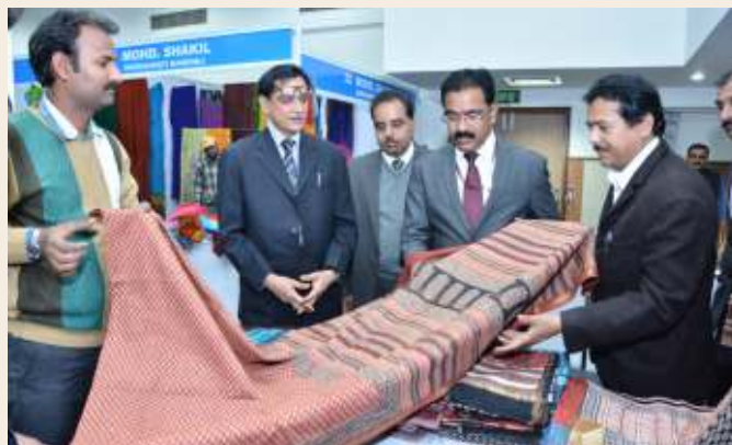
Mr K Gopal, Development Commissioner – Handicraft, Ministry of Textile, Government of India admiring the fine work of Artisans