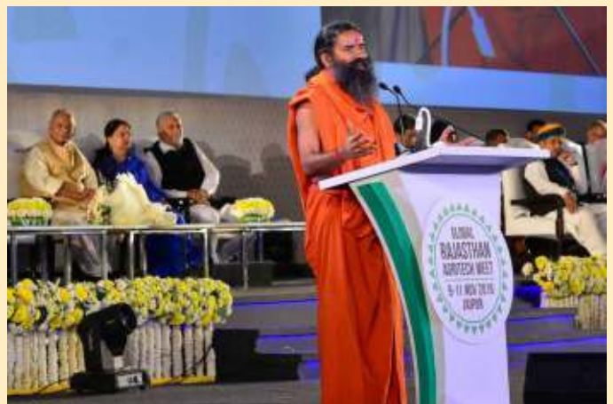
Yog Guru, Baba Ramdev addressing during the Inaugural Session