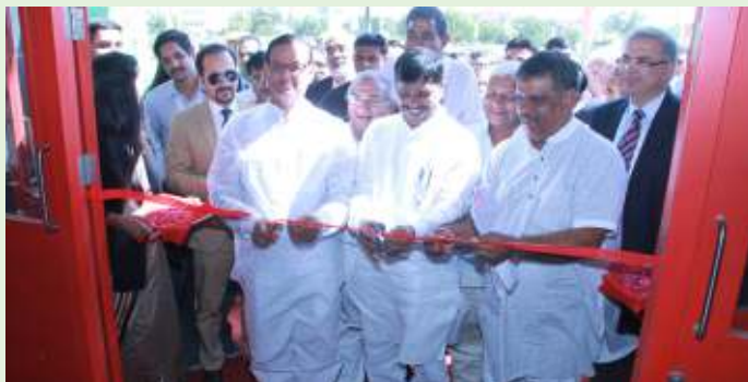
Inauguration of exhibition by Shri Gajendra Singh, Hon'ble Industry Minister, Govt of Rajasthan; Shri Rudrappa Manappa Lamani, Hon'ble Textile Minister, Govt of Karnataka and Shri Ramcharan Bohra, Hon'ble Member of Parliament from Jaipur