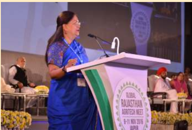
Smt Vasundhara Raje, Hon'ble Chief Minister of Rajasthan addressing during the Inaugural Session