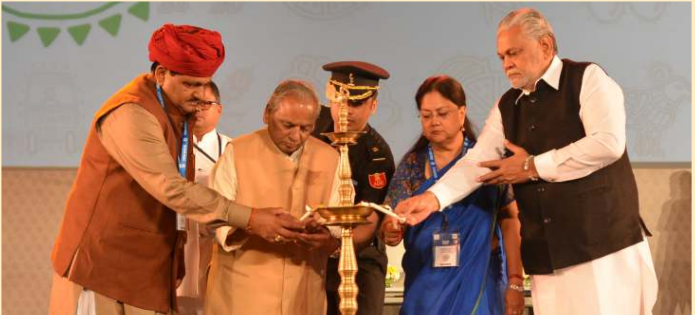
Lamp lighting by Shri Kalyan Singh, Hon'ble Governor of Rajasthan; Smt Vasundhara Raje, Hon'ble Chief Minister of Rajasthan; Shri Parshottam Rupala, Hon'ble Union Minister of State for Agriculture & Farmers Welfare and Shri Prabhu Lal Saini, Hon'ble Minister for Agriculture, Government of Rajasthan

Global Rajasthan Agritech Meet (GRAM) was the largest event, ever organised in the state, with farmers as the epicentre of all the activities. The programme featured international exhibition, conferences, jajam baithaks and business interactions.