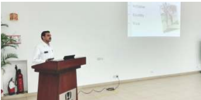
Official from Honda Cars India Ltd making presentation on Best Manufacturing Practices

The Mission focused on improving the competitiveness of manufacturing units through learning on latest technology, innovation, service delivery, lean manufacturing and defect free products for Zero Defect and Zero Effect (ZED), skill development, training, etc.