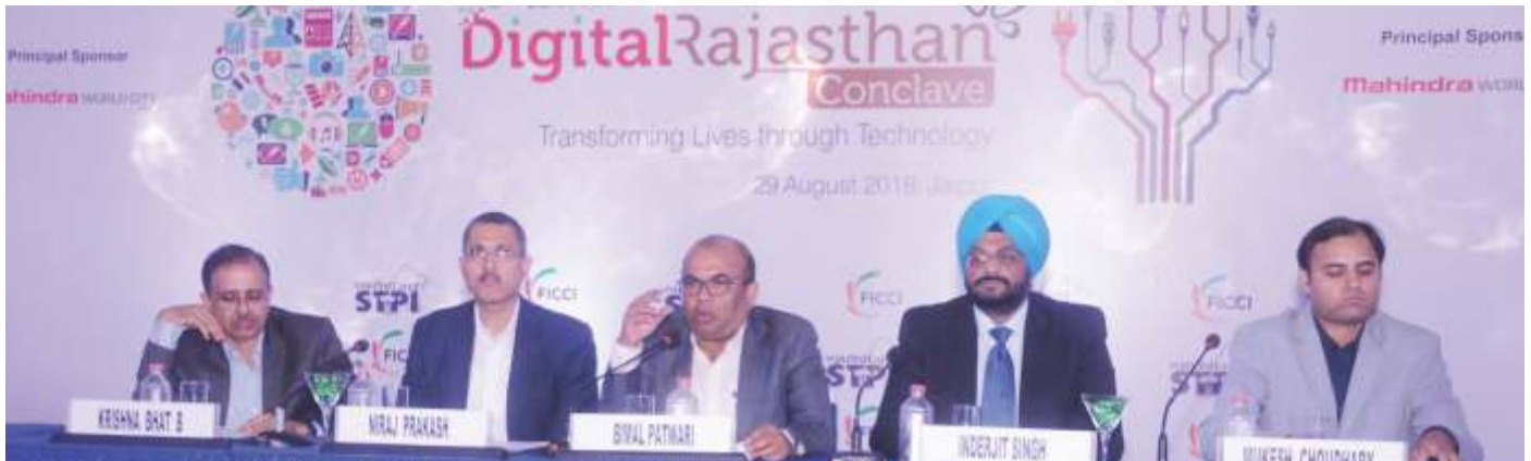
Speaker interacting during session on Emerging Cyber Threats & Data Privacy

Since emerging trends and technologies have redefined the way we work, it has raised questions related to privacy and security; Artificial Intelligence in Cyber Security, Security & Data Protection, General Data Protection Regulation and Social Media Threats were the key topics under session on 'Emerging Cyber Threats & Data Privacy' while 'Emerging Technologies & Trends' session saw experts talk about Future Trends in Cloud, Computing, Block Chain used for Trade and Finance Efficiency, etc.