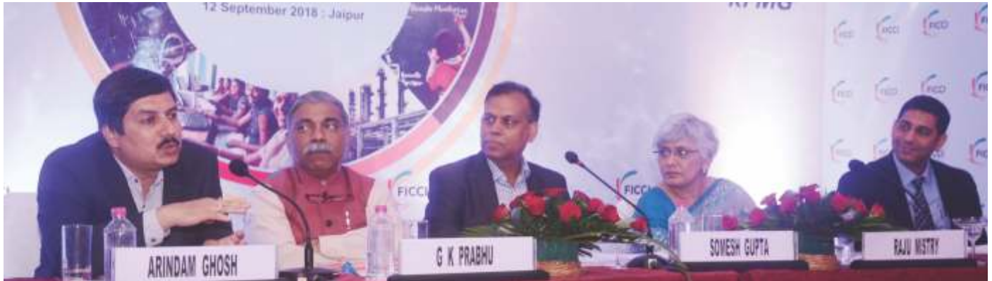
Speaker during the session on HR Imperatives for Evolving Organizations and Building Capacity for Future

Two plenary sessions on “Re-imagining the Role of HR” and “HR Imperatives for Evolving Organizations and Building Capacity for Future” were organised.