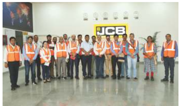
Mission participants at JCB India Ltd, Pune

Against the backdrop, FICCI Rajasthan State Council took a mission of Learning by Sharing and organised a series of Learning Missions on Manufacturing Excellence to different part of country including cities like Chennai, Bengaluru, Pune, Gurgaon, Tapukara wherein the participants visited to some of the best manufacturing facilities of prominent organisations.