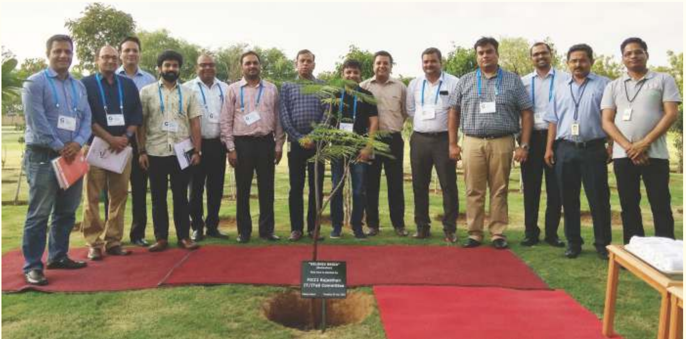
Tree Plantation by FICCI Sub-committee on IT & ITeS members at Infosys Ltd