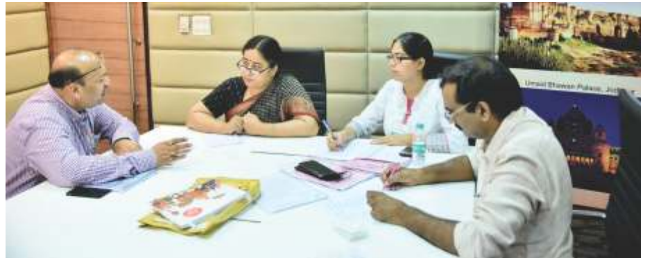
Government of Rajasthan official having B2B meeting with prospects