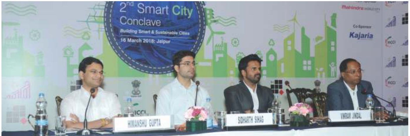
Commissioners of Municipal Corporations of Udaipur, Ajmer and Kota during the Plenary Session

In another Plenary Session on “Smart City: Drivers and Enablers”, senior speakers from Dell International, ESRI India, Shuttl, etc. shared the best practices and views on Urban Mobility, Waste Management, GIS for Urban Transformation, Security Transformation for Smart Cities, etc.