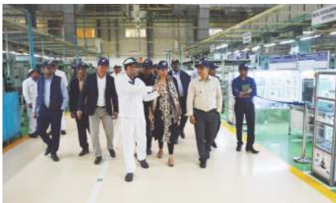
Delegates during Shop Floor Visit at Honda Motorcycle & Scooter India Pvt Ltd, Tapukara

Industry and businesses worldwide are striving to formulate strategies, sharpen operations, bring down costs, improve quality and differentiate products to increase their worth in the market. This is an era of continuous improvement in thoughts & processes, which is the only way to move towards competitiveness. The competitive pressures on the Manufacturing Industry, in terms of productivity, quality, delivery and safety call for a strategic and holistic approach that the industry needs to adopt to make their operations “World Class”. With the Manufacturing Sector gaining business maturity, it is important to explore new and innovative horizons for sustaining the growth in the industry to deliberate and unleash full potential of the Manufacturing Industry, as well as to promote best practices among the manufacturing sector.