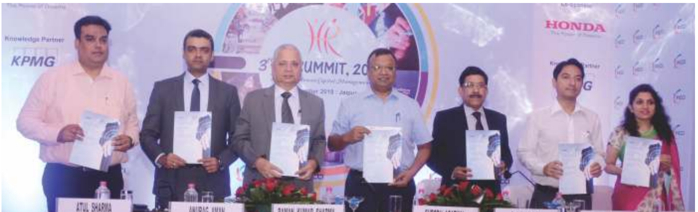
Release of FICCI – KPMG Report on "Imagineering the Future of HR Organisation"