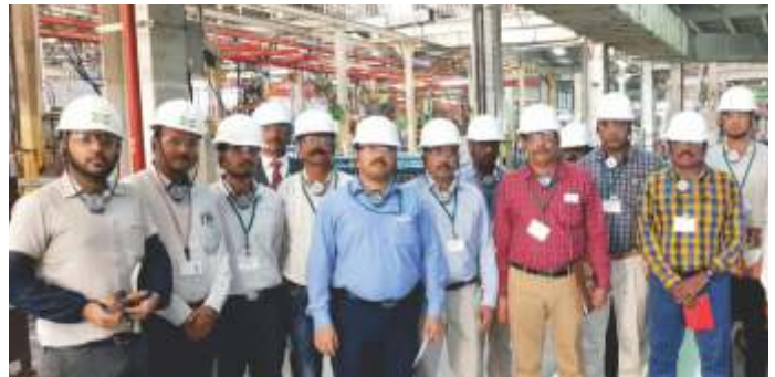
Mission delegates during Plant Visit at Renault Nissan Automotive India Pvt Ltd

These visits comprised of presentation highlighting the best practices followed by the respective companies alongwith interaction with senior officials from the organizations and also the plant visit giving real picture of best manufacturing practises implemented. By attending the learning mission, participants benefited in terms of: