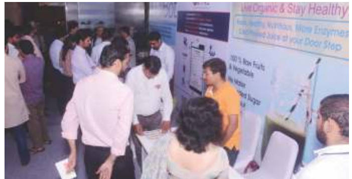
Display by Start-ups