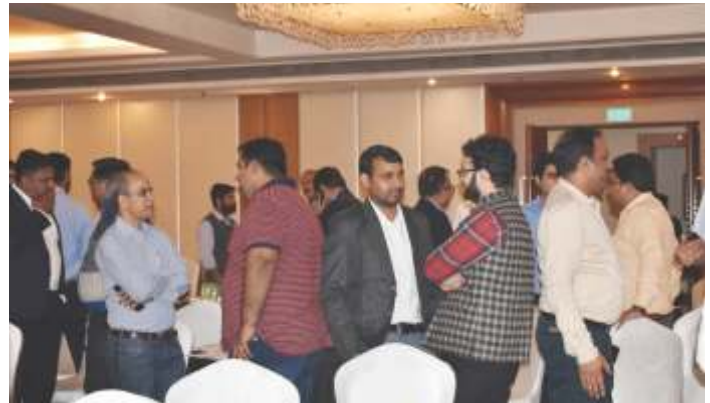
Group Activity in progress during Workshop