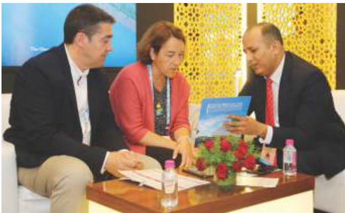
Foreign Tour Operators having B2B Meeting with Seller