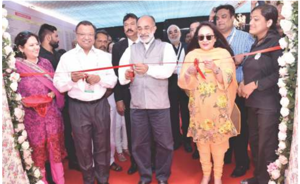
Shri K J Alphons, Hon'ble Minister of State (Independent Charge) for Tourism, Government of India inaugurating the GITB exhibition

The programme went off very well with around 11,000 B2B meetings between buyers and sellers; 280 leading inbound foreign tour operators from 55 countries; 270 Indian sellers including Tour Operators, Hotels, Resorts, Spa & Wellness, International Airline and State Tourism Boards.