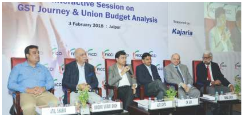
Senior Government Officials during interaction with Industry members