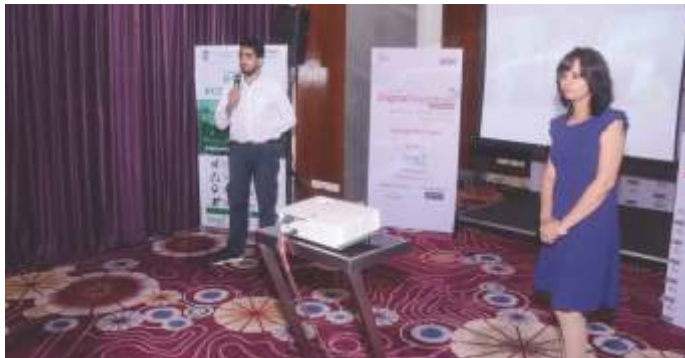
A Start-up Pitching for funding

The Start-up Conclave provided exposure to the emerging start-ups about the use of digital technologies in solving real time problems. At Start-up Pitch Town 13 start-ups presented their proposals in front of the angel investors, venture capitalists and start-up mentors for raising funding for their start-ups. Startup Oasis curated the Startup Conclave, Pitch Town and Startup display.