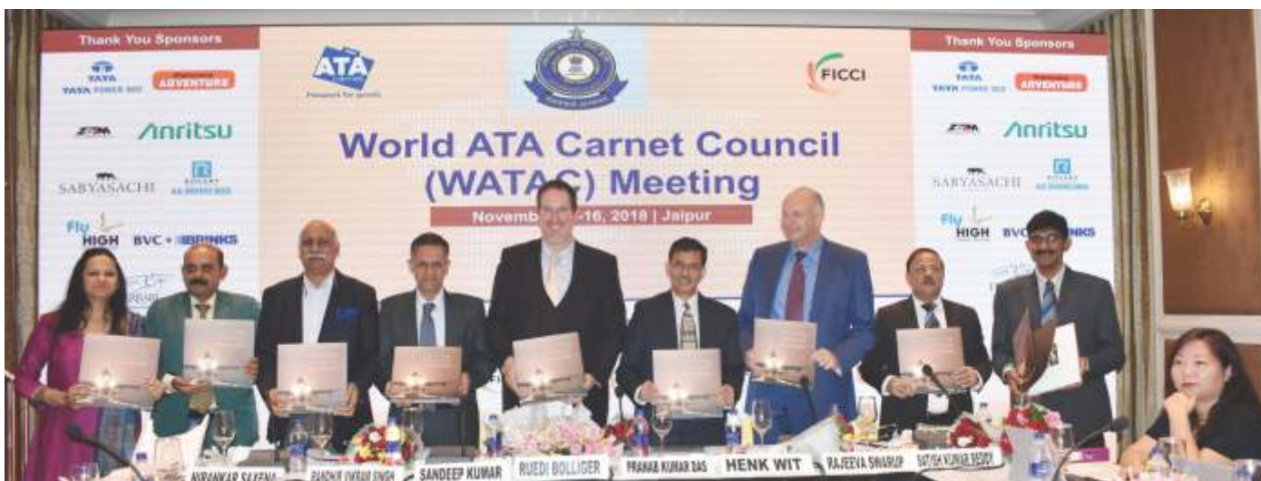
Release of coffee table book on 'Ease of Doing Business: ATA & UN TIR Carnet'

On day two, International Workshop on “ATA Carnet System” held wherein various presentation were made by Netherlands Chamber of Commerce & Industry; London Chamber of Commerce; FICCI; ICC WCF International Certificate of Origin Council; World ATA Carnet Council (WATAC) and Keynote address was delivered by Mr S C Agarwal, the Commissioner of Customs, Jaipur.