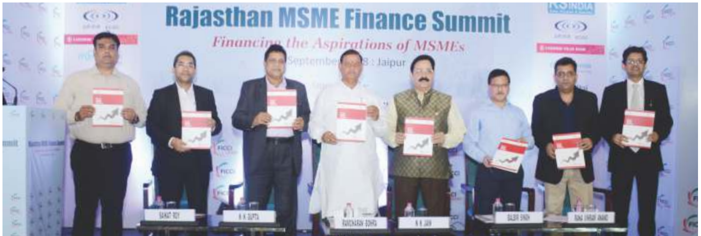
Release of FICCI – Resurgent Report on “Key to SME Growth”

The programme featured Sessions on Credit Flow to MSMEs – Issues & Solutions and Financial Instruments for MSMEs wherein around 15 speakers from RBI, SBI, CARE, SIDBI, Indifi, OfBusiness, Lakshmi Vilas Bank, etc addressed the sessions and around 125 participants took part in the summit.