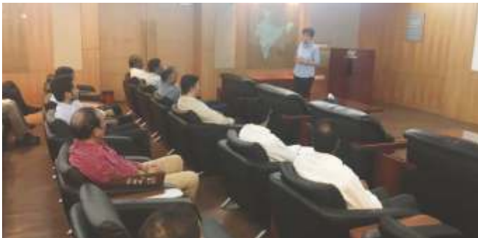
Interaction with Officials of Hyundai Motor India Ltd on manufacturing excellence

The objective of these missions was to provide opportunity to participants for learning and understanding the best manufacturing & quality practices in sync with our endeavour to promote learning through sharing.