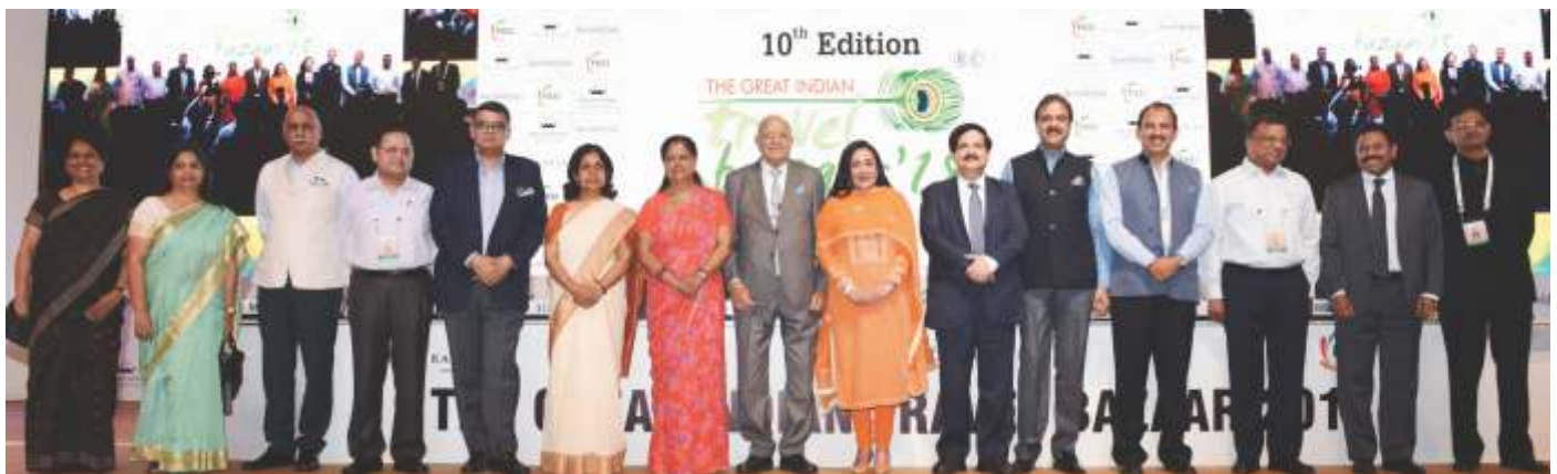
Dignitaries during the Inaugural Session of GITB 2018