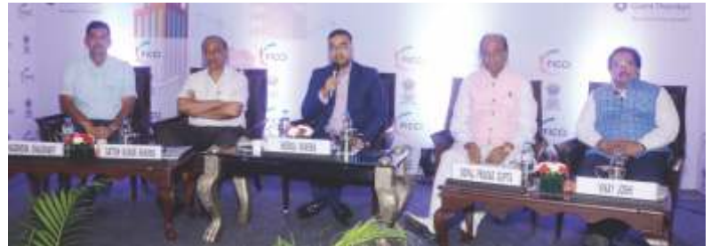
Panel Discussion on RERA and Affordable Housing