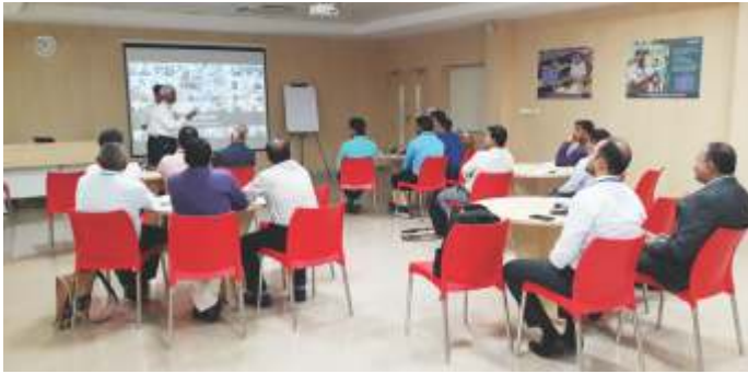
Officials from Volvo Group India Private Limited making presentation on best manufacturing practices