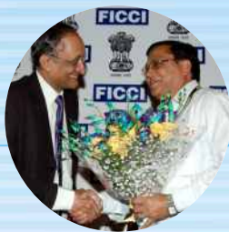
Dr. V.K. Saraswat Secretary, DRDO