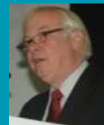
Lord Chris Patten Chancellor, University of Oxford FICCI HES 2007

"The possibilities of our working together more closely on higher education and research are almost literally boundless. We are collaborating on the scope for private provision in education; a point which I know is of particular interest to FICCI."