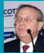
Dr Richard Levin President, Yale University, FICCI HES 2009

"In our 'knowledge economy,' nations prosper by virtue of their capacity to innovate - to develop and introduce new products, processes, services, and even, new ways of thinking."