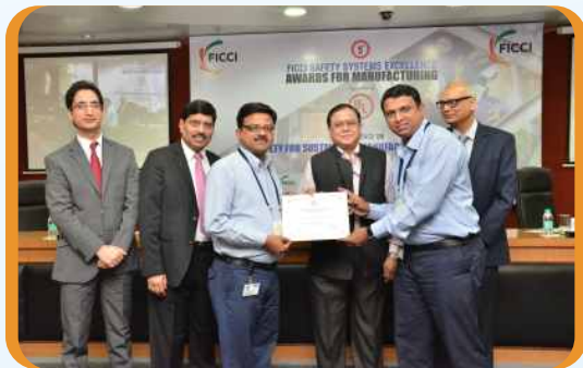
Dr V K Saraswat, Member, NITI Aayog, presenting the awards