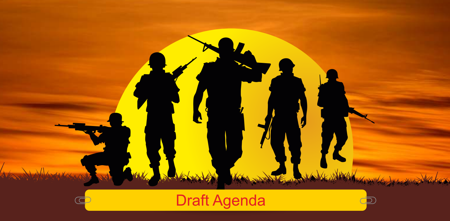
Day 1: September 17, 2018 (Monday)