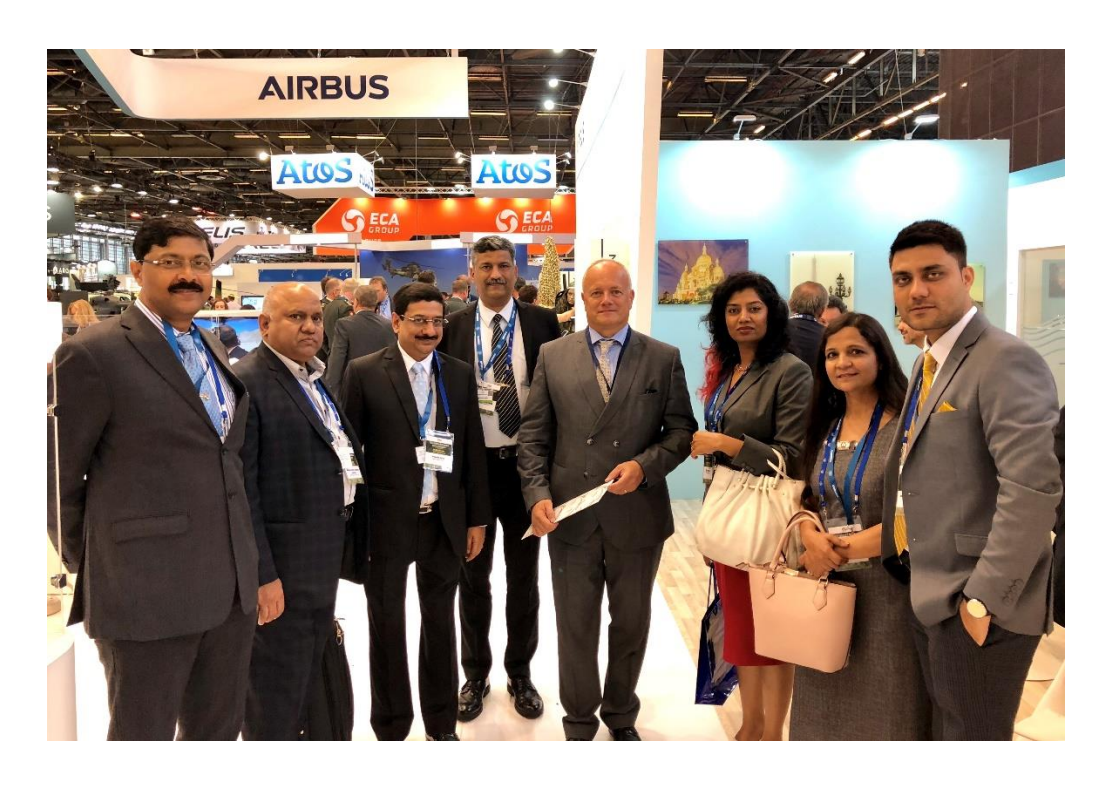
Delegation meeting with AIRBUS