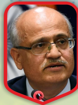
SHRI VIJAY GOKHALE Former Foreign Secretary