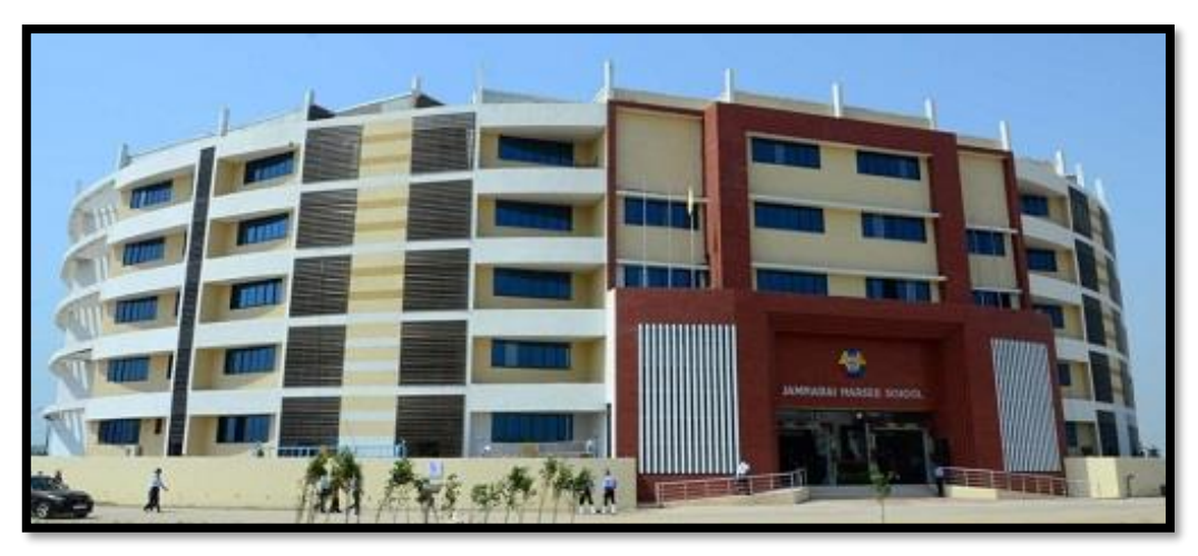
Jamnabai Narsee School ICSE Board - 1500 students