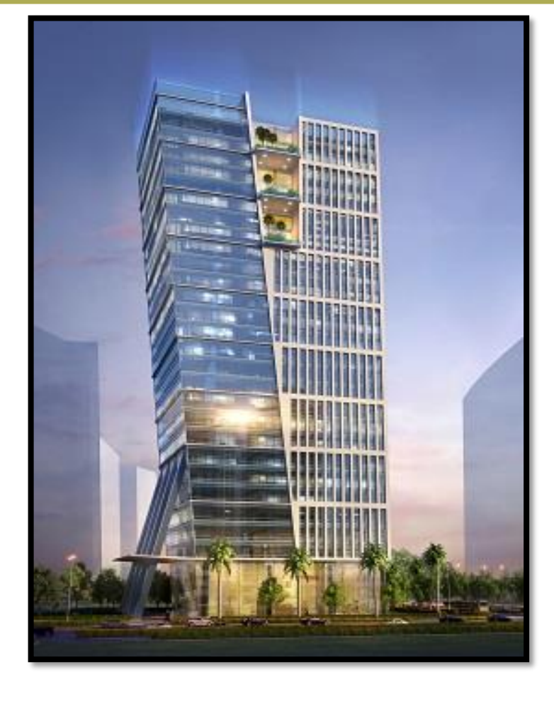
Signature Tower by Hiranandani Group 0.3 mn Sq.ft BUA (SEZ)