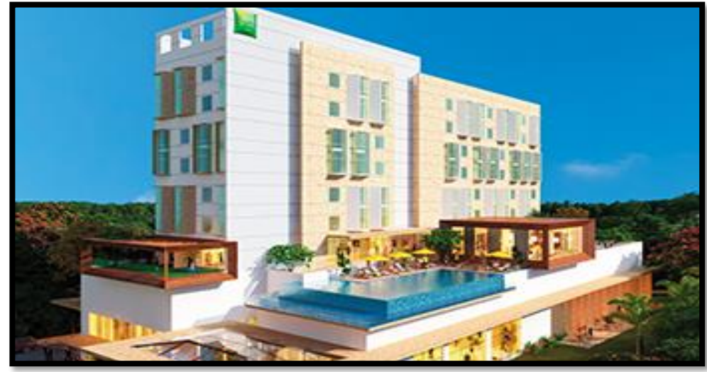
Brigade Group Hotel 150 Rooms