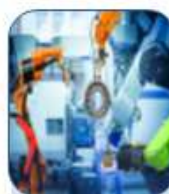
Manufacturing (including energy)