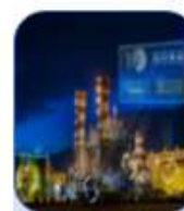
Power (including transmission, distribution and generation)